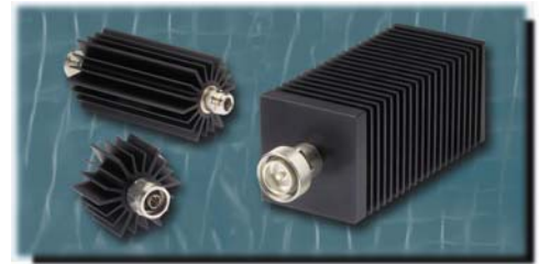
Figure 1: Broadwave Terminations

Although, most transmission lines are 50 \Omega or 75 \Omega (for some communication systems), there are also terminations available to match specific characteristic impedances.