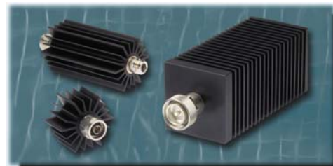
Figure 3: Broadwave Conduction Cooled Termination